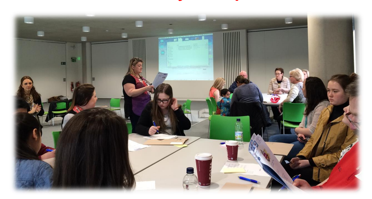
Alder Hey Children's NHS Foundation Trust 19<sup>th</sup> March 2016

Report by The Lupus Team, Centre of Excellence for Childhood Lupus at Alder Hey Children's Hospital